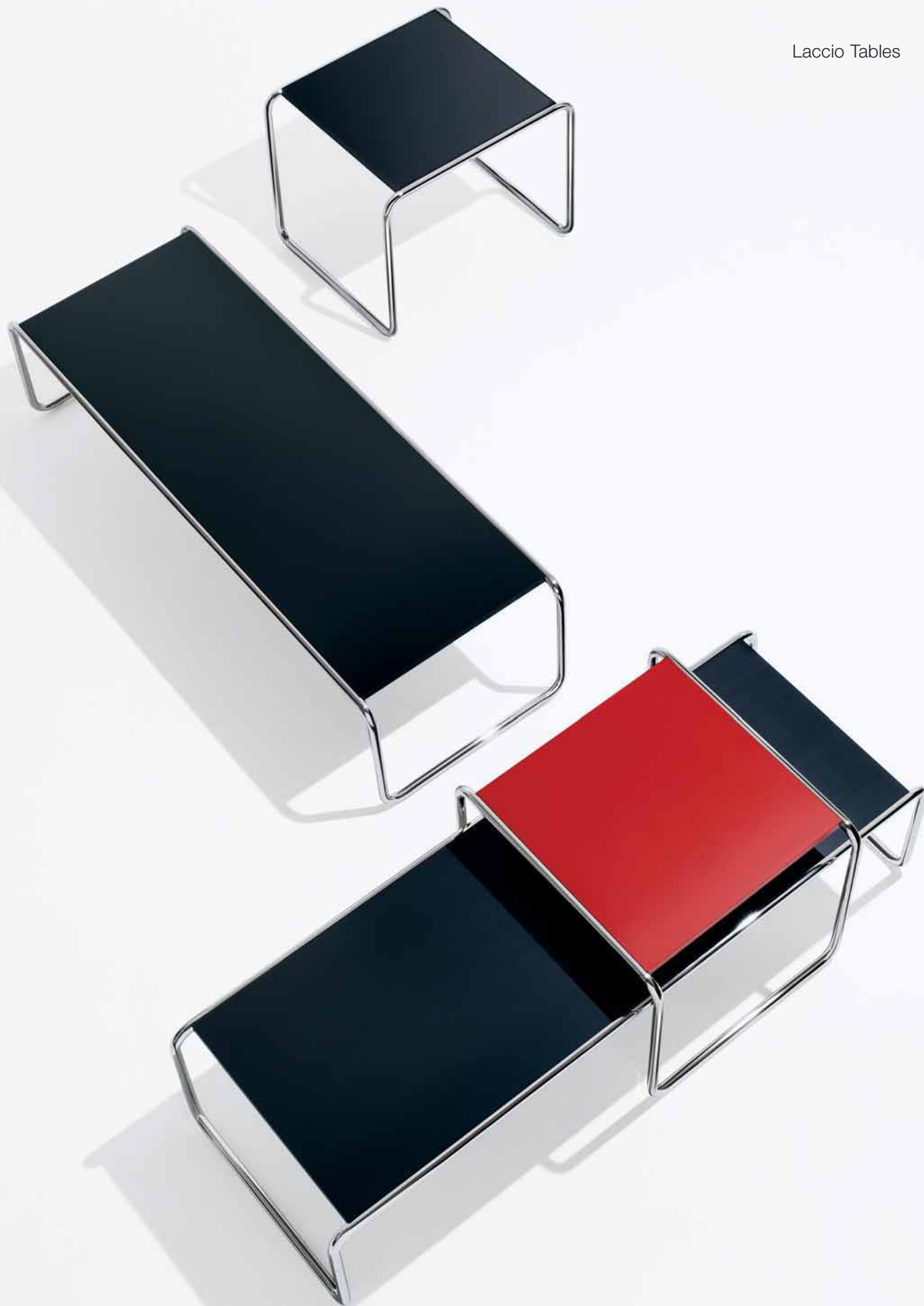
A study of lines in space, the Wassily Chair and Laccio Tables, shown left in the Bauhaus building in Dessau, Germany, stand as paradigms of Modernism. Laccio Tables, above, in Black and Red laminate; Tables also available in White laminate.