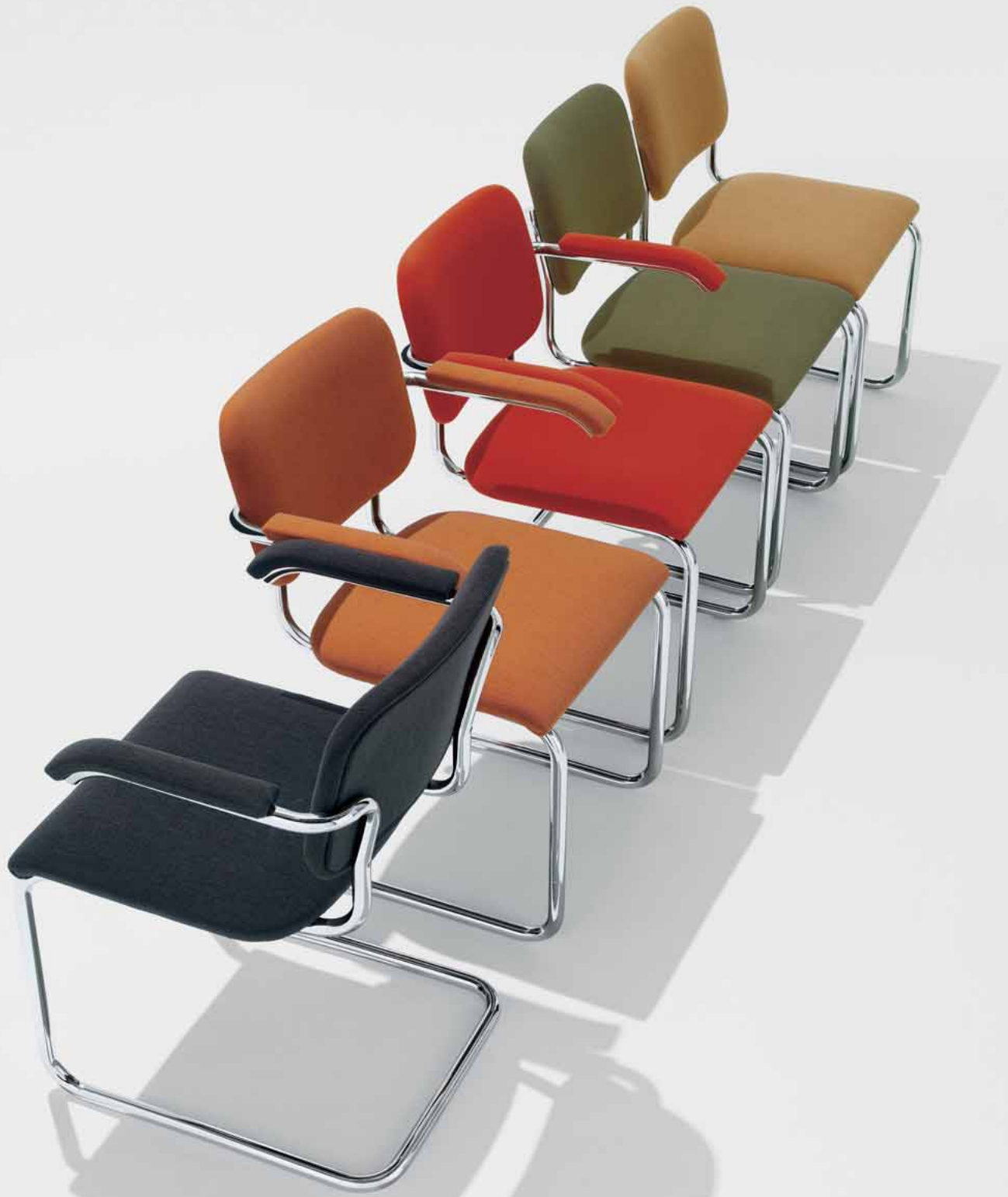
Cesca Chairs, above, fully upholstered with Spencer textile in Granite, Apricot, Saffron, Bay Leaf and Flax. Cesca Chairs, right, in Natural Clear Beech with handwoven cane inset seat and back. Cesca Chair with arms in Ebonized Beech with handwoven cane inset seat and back also shown.